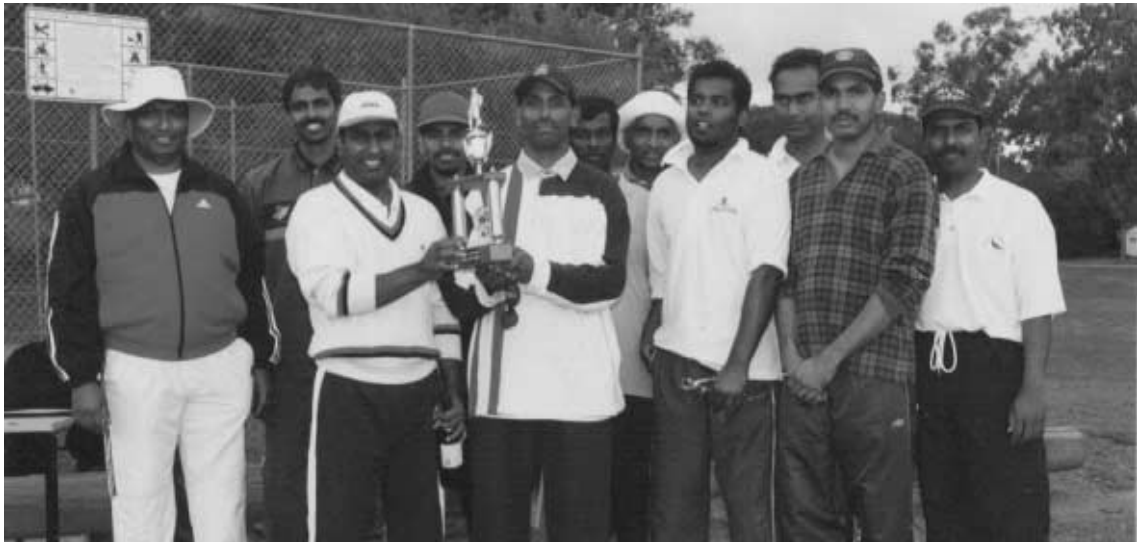
Hartley College Winning the Cricket match against Hindu College